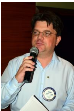
Four Way Test